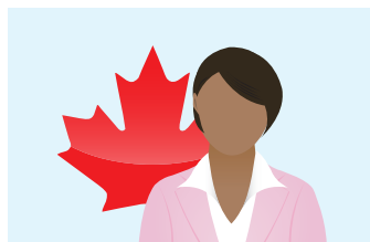
107 Elected Officials