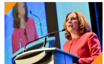
Parliamentary Secretary to the Minister of Natural Resources, Kim Rudd (Delivering the 2018 Opening Address)