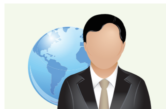
58 International Delegates