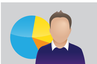
240 Senior Executives

In 2017, we hosted an audience of over 750 individuals from within and outside Canada's nuclear industry. The high profile of our delegates makes the CNA Conference an excellent venue to showcase your business. Here's a quick snapshot of who came in 2017: