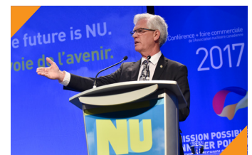
Minister of Natural Resources, Jim Carr (Delivering the 2017 Opening Address)