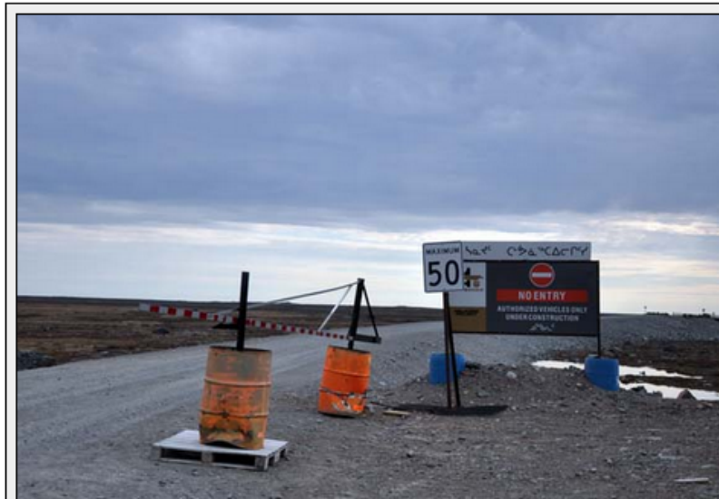
Signage marks the beginning of Agnico Eagle Mine's 24-kilometre road that links the community of Rankin Inlet to its Meliadine gold mine project site.

The KIA is one of a handful of organizations that have submitted comments this month in response to Meliadine's final environmental impact statement (FEIS) , which AEM released this past spring .